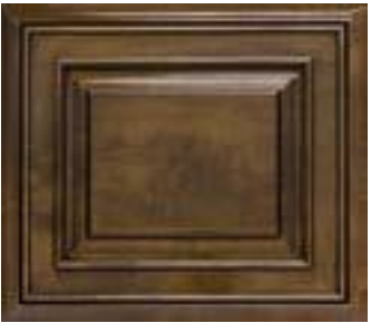
HIGH-GLOSS GLAZED PACIFIC