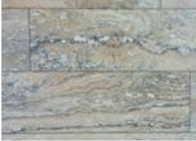
RESIDENTIAL VINYL FLOORING