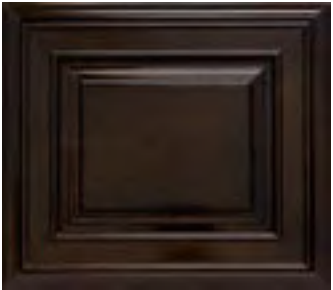
HIGH-GLOSS GLAZED MILAN