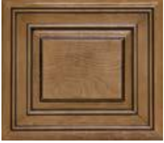
HIGH-GLOSS GLAZED NEWPORT