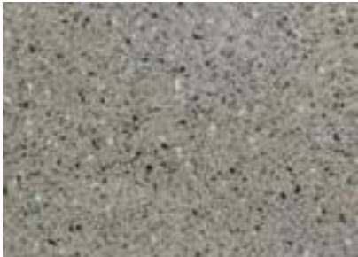
KITCHEN & DINETTE COUNTERTOP