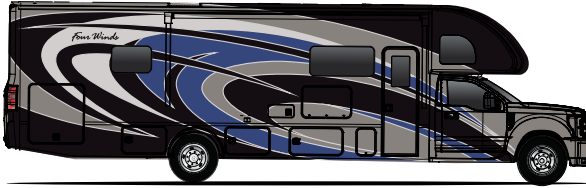
NIAGARA FALLS FULL-BODY PAINT