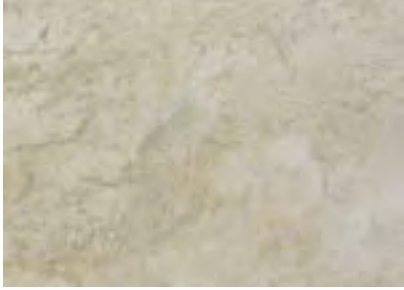
BED & BATH COUNTERTOP