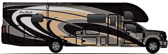
LUCKY CHARM FULL-BODY PAINT